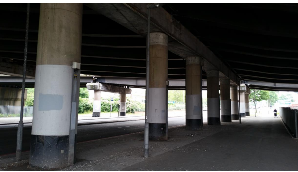
Photo: Pigeon defecation on footpaths under bridges, as seen here under the M5 at Oldbury.

Conversion of 'A roads' to motorway or Expressway Whenever an existing 'A' road is converted into a motorway, or upgraded to the proposed expressway standard, Highways England must carefully