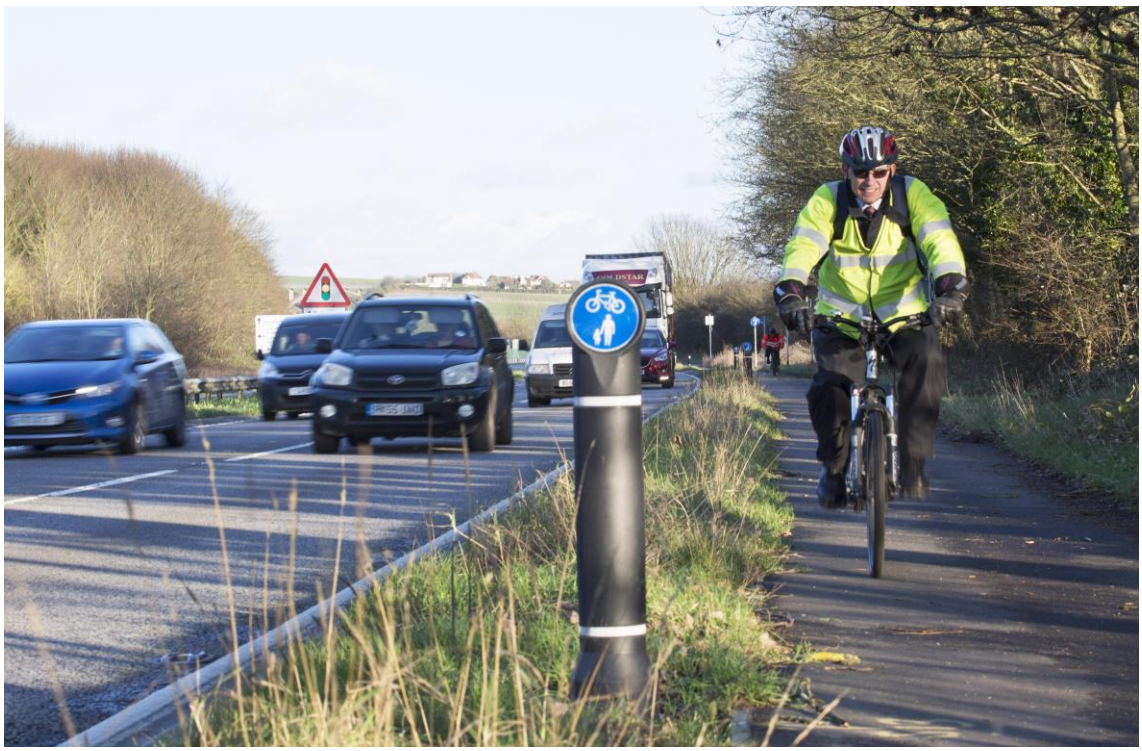
Photo: Cycling on a segregated path. Photo courtesy of Highways England.

We were told that the quality of cycling infrastructure is of key importance in maintaining current usage and in encouraging more cycling. As well as surface quality, other aspirations include shielding cyclists from excessive traffic noise; signage improvements; prevention of flooding; and improved links with other cycling routes. The latter should include close cooperation with local authorities to maximise connectivity.