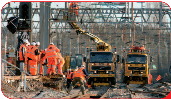
Engineers work to upgrade the line

The West Coast Main Line (WCML) upgrade will deliver passengers extra services to Manchester, Liverpool and other places, will mean more trains at the weekend and a substantial cut to journey times