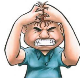
Image from passenger illustrating planned disruption

'Pain for a month but it will be worth it!'